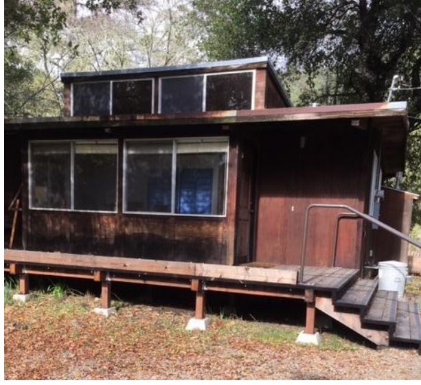
Exterior of the Guest House with ADA ramp on the left