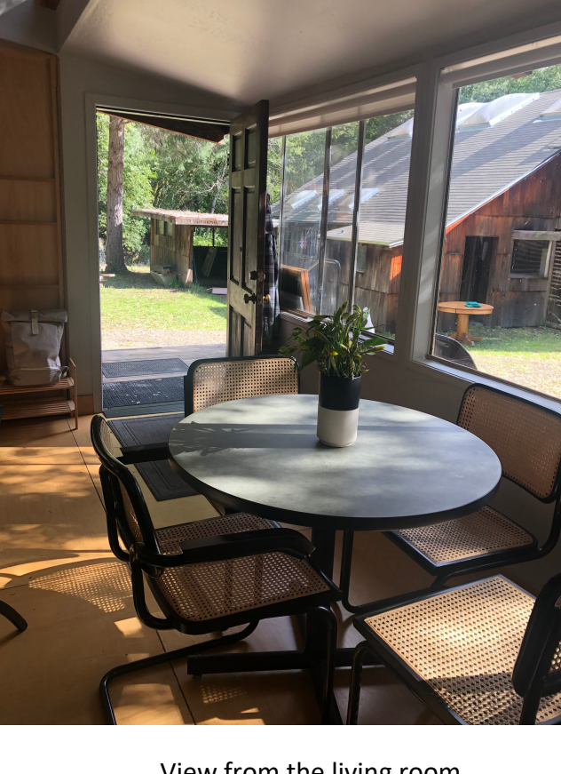
Kitchen View from the living room