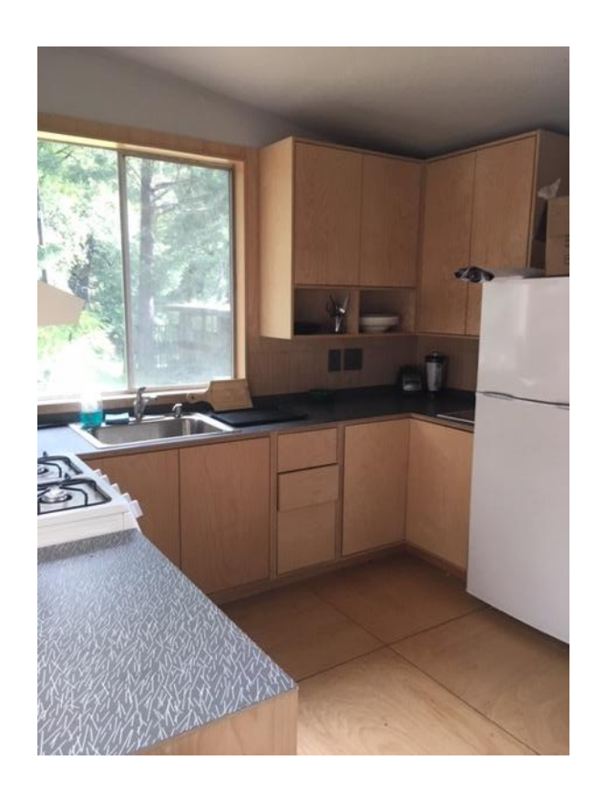
Kitchen with appliances